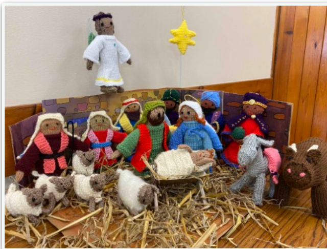
Ingham Craft Club's "Knitted Nativity"

Wishing you all a very Merry Christmas and a Happy New Year